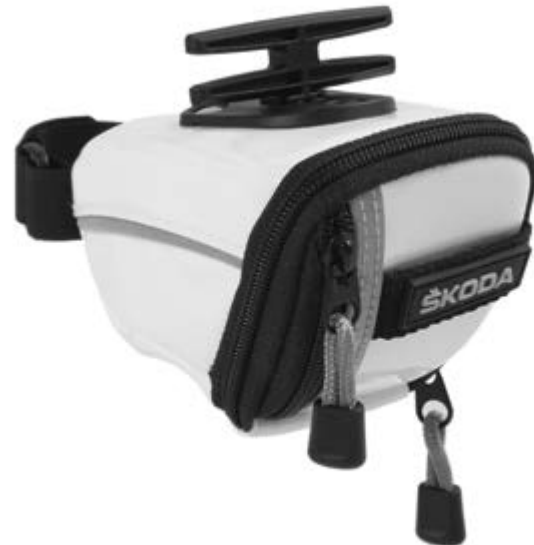
CYCLING SADDLE-BAG (ROAD)