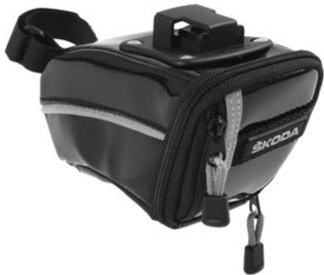
CYCLING SADDLE-BAG (MTB)